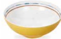
large salad bowl (yellow) – 24cm/9.25" COY67170-XD