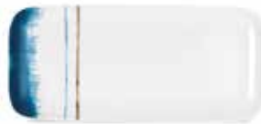
sandwich tray – 30cm/12" CO78087-XD