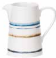
medium jug – 0.85L/1.5pt CO78060-XI