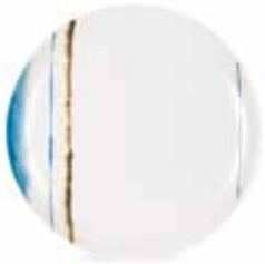
dinner plate – 28cm/11" CO67070-XF