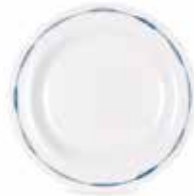
tea plate – 17.5cm/7" CO67055-XF