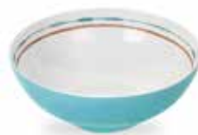
large salad bowl (blue) – 24cm/9.25" COB67170-XD