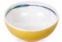
cereal bowl (yellow) – 19cm/6.5" COY67140-XF