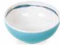
cereal bowl (blue) – 17cm/6.5" COB67140-XF