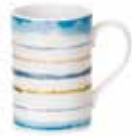
mug – 0.35L/12.5oz CO48823-XF