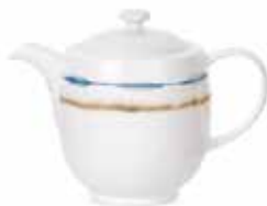
teapot – 1.35L/2pt COB67180-XD