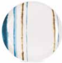
salad plate – 23cm/9" CO67060-XF