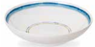
low bowl – 33cm/13" CO67160-XD