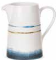
large jug – 1.70L/3pt CO72500-XI